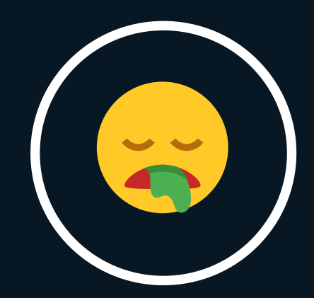
Throwing up or feeling like throwing up