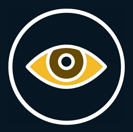
Yellowing of the eyes and skin