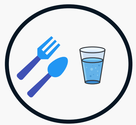
Eating or drinking foods contaminated by Hepatitis A

Having sexual contact with infected partner(s)